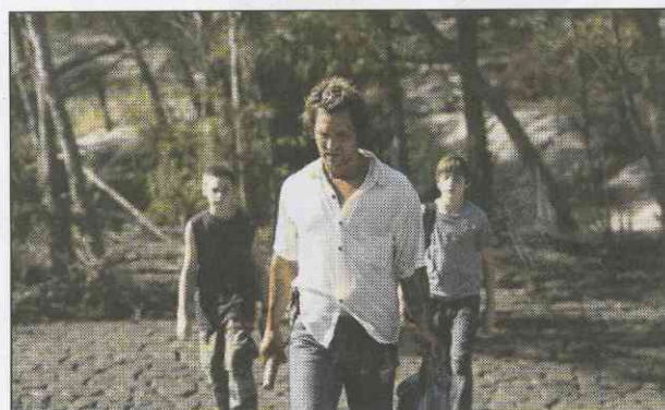
Matthew McConaughey leads from the front in Mud .