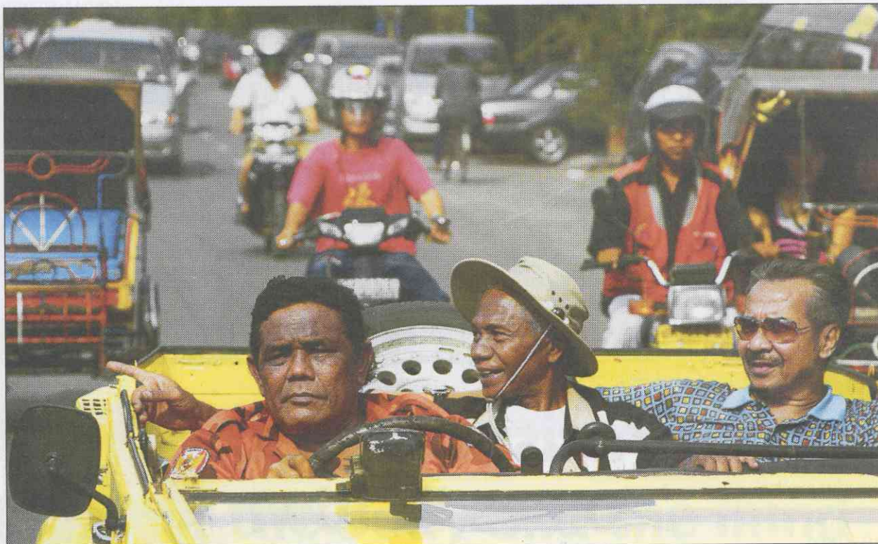
Still from The Act of Killing whose director, Robert Oppenheimer, will be in attendance at HIFF.